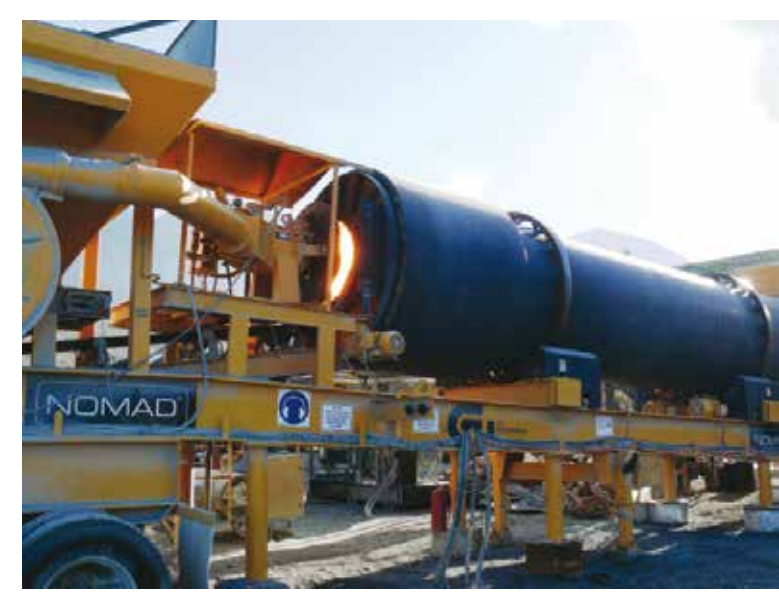
Nomad 1 mobile plant

Much Asphalt's HMA products are supplied from static asphalt mixing plants in all South Africa's major centres as well as from several mobile plants designed to supply quality product to remote projects.