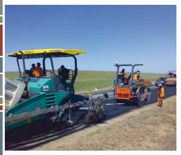
N2 Mthatha, Eastern Cape

Appropriate, individualised solutions are offered to clients depending on factors such as traffic frequency and type of road use, safety, weather conditions and noise. The size and quality of aggregates, as well as the grades and types of bituminous binders, influence strength, durability and texture of the road surface. In general terms, new and rehabilitated roads using HMA have a design life of about 20 years until major rehabilitation interventions are needed.