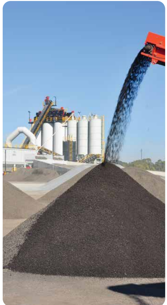
AECI Much Asphalt undertakes asphalt recycling to reduce carbon footprint and protect non-renewable resources.

We play a leading role in introducing new products to the local market with the associated testing and road trials.