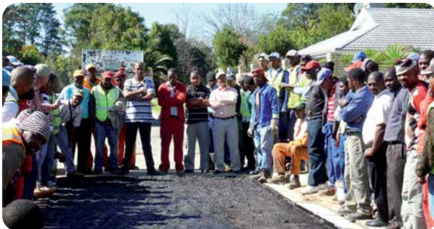
Hand asphalt training taking place in George

The future of job creation in South Africa lies with SMMEs and training is essential to ensure these businesses have the skills to be sustainable. AECI Much Asphalt provides free workshops on best practice in the placement of hot mix asphalt to assist SMMEs, local and provincial authorities. Thousands of individuals have received this practical training since it was launched 2006.