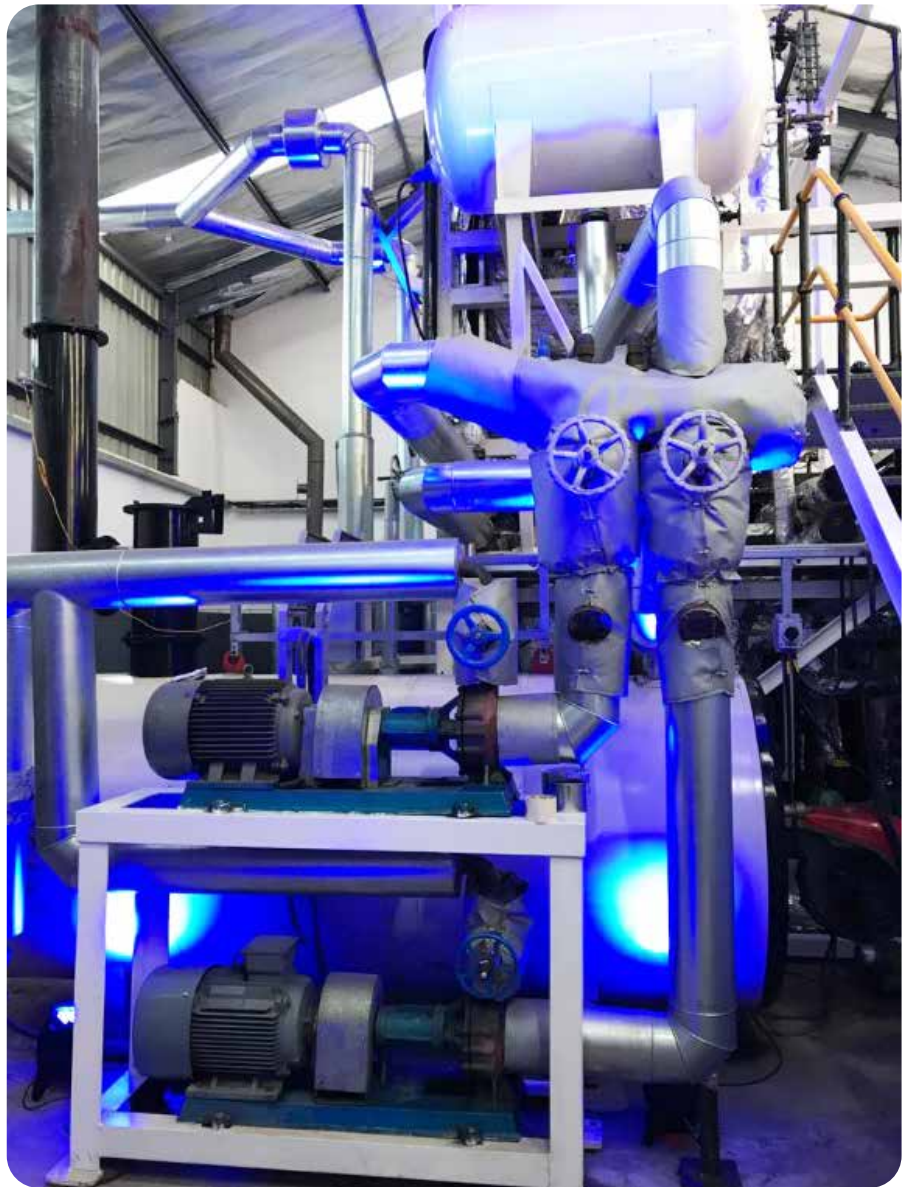
Multistage bitumen converter

Bituminous products manufactured in the converter in Cape Town are available to all asphalt manufacturers in South Africa.